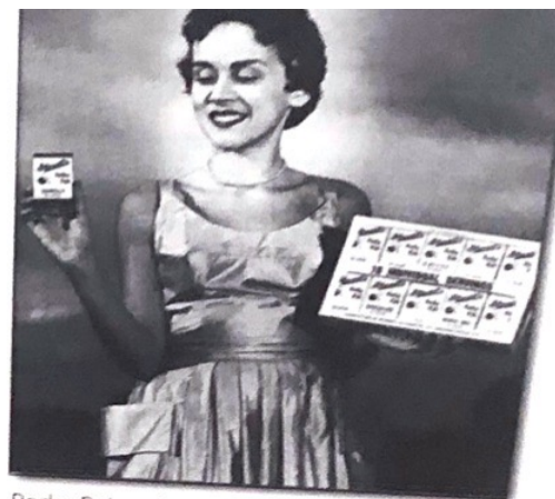
Perky Pak gal The model is showing off an innovation, pre-packaged portions of ice cream. The Stewart Story, September 1954

Brookside Museum Saturdays and Sundays from Noon to 4 pm The SCHC Brookside Museum is located on 6 Charlton Street in Ballston Spa, NY 12020. Admission to this museum is free and donations are welcome.