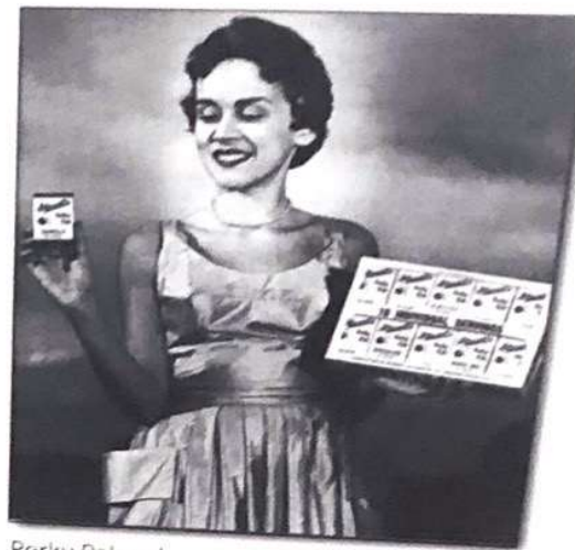
Perky Pak gal The model is showing off an innovation, pre-packaged portions of ice cream. The Stewart Story, September 1954

Brookside Museum: Saturdays and Sundays from Noon to 4pm. The SCHC Brookside Museum is located on 6 Charlton Street in Ballston Spa, NY 12020. Admission to this museum is free and donations are welcome.