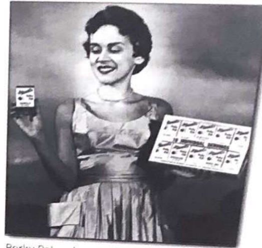
Perky Pak gal The model is showing off an innovation, pre-packaged portions of ice cream. The Stewart Story, September 1954

Brookside Museum: Saturdays and Sundays from Noon to 4 pm. The SCHC Brookside Museum is located on 6 Charlton Street in Ballston Spa, NY 12020. Admission to this museum is free and donations are welcome.