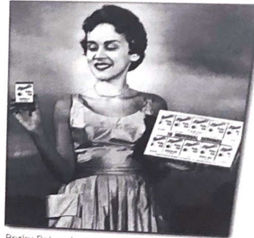
Perky Pak gal The model is showing off an innovation, pre-packaged portions of ice cream. The Stewart Story, September 1954

Brookside Museum Saturdays and Sundays from Noon to 4 pm The SCHC Brookside Museum is located on 6 Charlton Street in Ballston Spa, NY 12020. Admission to this museum is free and donations are welcome.