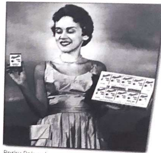
Perky Pak gal The model is showing off an innovation, pre-packaged portions of ice cream. The Stewart Story, September 1954

Brookside Museum: Saturdays and Sundays from Noon to 4 pm. The SCHC Brookside Museum is located on 6 Charlton Street in Ballston Spa, NY 12020. Admission to this museum is free and donations are welcome.