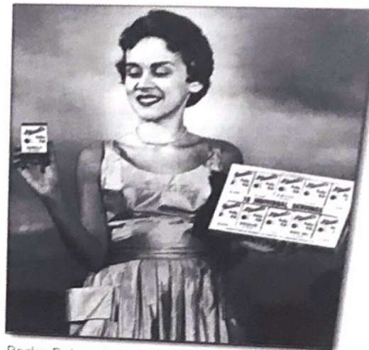
The model is showing off an innovation, pre-packaged portions of ice cream. The Stewart Story, September 1954