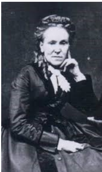
Matilda Joslyn Gage

Sponsored by the National Collaborative for Women's History Sites, the National Votes for Women Trail seeks to recognize and celebrate the enormous diversity of people and groups active in the struggle for women's suffrage. The NVWT consists of both a growing virtual trail of over 2300 sites, as well as a physical trail of over 200 historical roadside markers. To learn more, please visit nvwt.org . The roadside markers are generously funded by the William G. Pomeroy Foundation, a private, grant-making foundation based in Syracuse, N.Y.